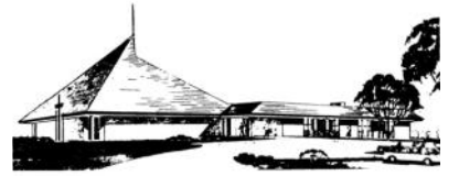
First Presbyterian Church

Our current church building was dedicated on December 17, 1978. The placard mounted at the entrance reads: "Dedicated to the Glory of God, in memory of Maude Evans whose generosity made construction of this building possible." It cost approximately $600,000 to construct. Several items from the old brick and stone church were saved and reside in our church today, including two stained glass windows (in office area), the font, pulpit, and communion table (in narthex), the church-tower bell (at our entranceway), and the cornerstone dated 1900 (below the bell). Our current facility is beautifully designed for a congregation our size and with a single-floor and paved parking lot, it is completely handicapped accessible. With a flexible seating design, the entire sanctuary can be rearranged for a new look at no cost. This will serve the needs of the future well as tastes change over time. With a state-of-the-art zoned heating and air conditioning system, we have a very "green" facility.